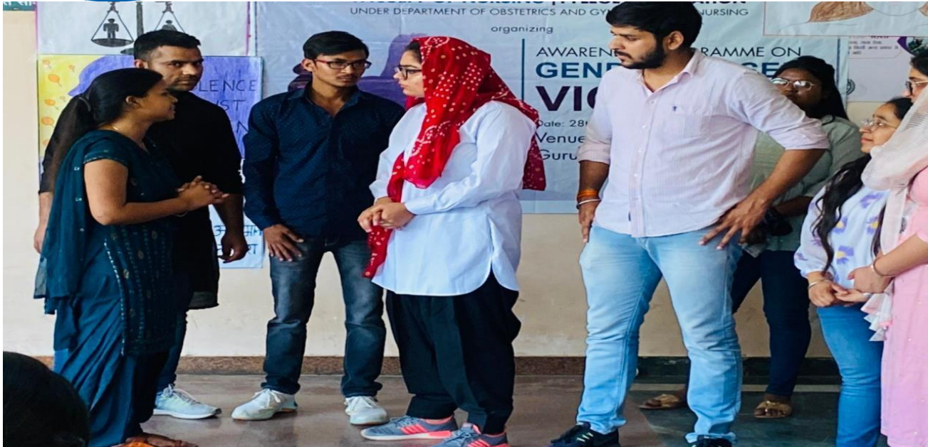
B.Sc. Nursing 4 th year students aware the people for the Girl's Education