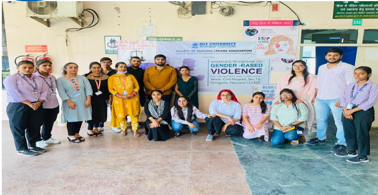
Organizing Team Members of the Programme