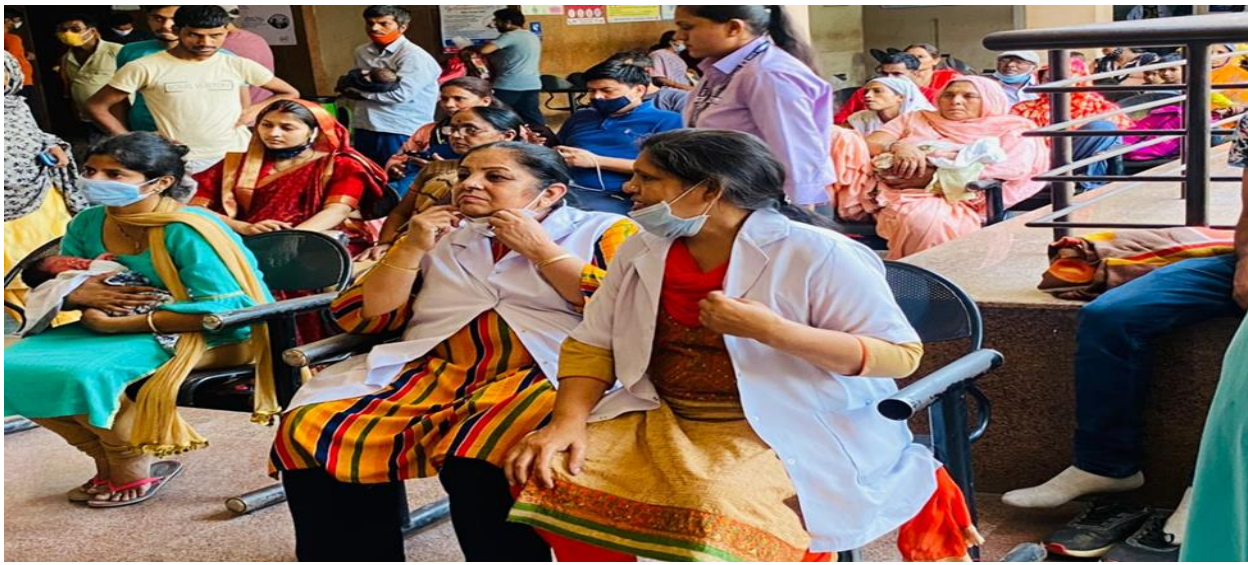
Hospital Staff and the community peoples attending Role Play